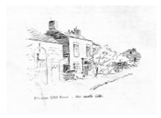
Drawings by Larry Carr