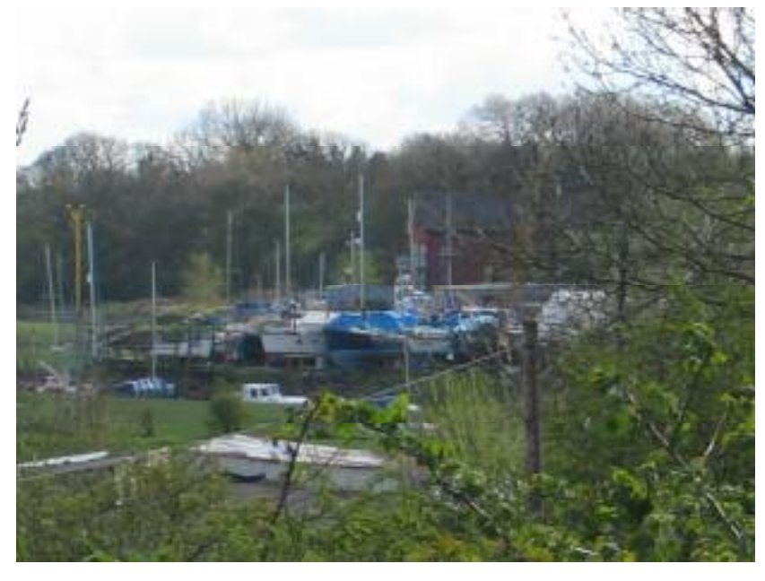
Freckleton Boat yard