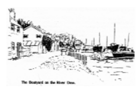
Drawing by Larry Carr

Up until the Second World War, the main industries were agriculture, weaving, (Balderstone Mill), rope making and shipbuilding. During the Second World War, our American allies established the BAD 2 airfield, which is now BAe Systems. Following the war, the population of Freckleton increased rapidly; with new housing estates being built on the disused service quarters (Brownfield sites) such that the population increased to 6045 people as indicated by the 2001 census. Today Freckleton is the largest village in the Fylde.