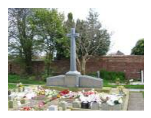
The Children's memorial

The results of this work, and actions arising, are outlined in this document.