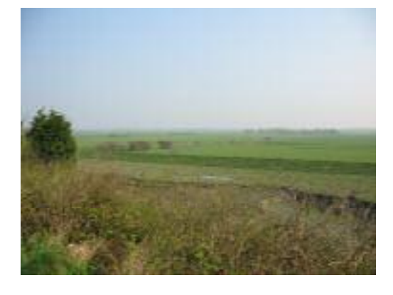
Freckleton Marsh – Freckleton pool in the foreground

After all, the future of the Parish of Freckleton will depend on what they can offer in terms of employment, and this in turn will dictate the quality of life for the residents of Freckleton.